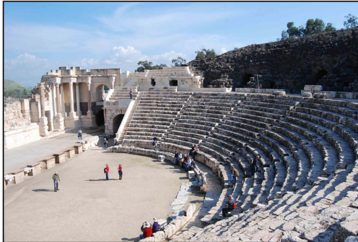
This Roman theater is located in the town of Bet She'an.

For about five more minutes we were allowed to just walk around, and as we did a couple of verses came to mind. The first was Ephesians 2:18, which says, "For through Christ we both have access in one Spirit to the Father." The other verse was 1 Peter 2:9-10, which says, "You are a chosen people, a royal priesthood, a holy nation, a people belonging to God, that you may declare the praises of Him who called you out of darkness into His wonderful light. Once you were not a people, but now you are the people of God; once you had not received mercy, but now you have received mercy."